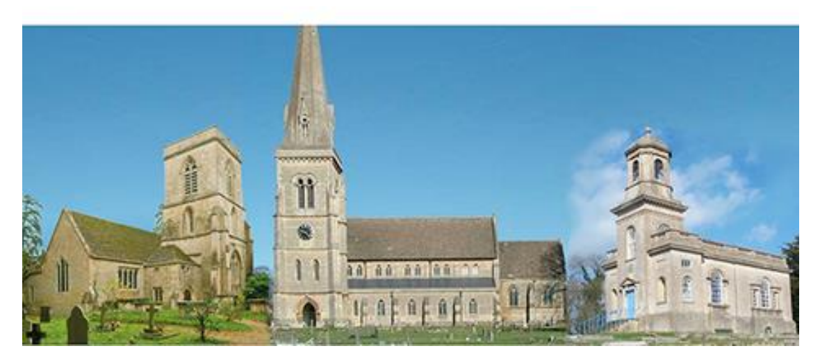
St Peter's Langley Burrell