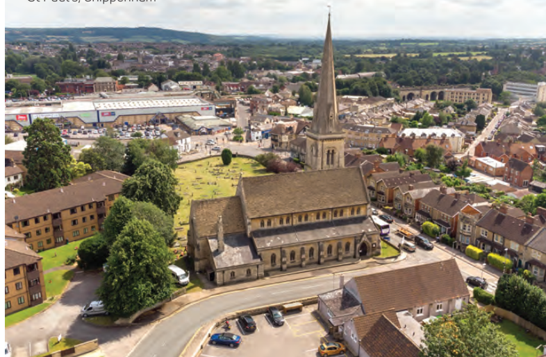
St Paul's, Chippenham